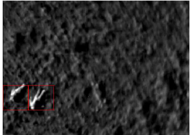
Figure 3: Two persons lying on the floor, sensed with a GSD of 5cm x 5cm, and the AFD mechanism providing its detection

As the thermal camera resolution is of 320 x 240 pixels, and that is quite low, one may think on taking advantage of the large image forward-overlap (acquisition frequency ranging from 4 Hz to 25 Hz) to enhance its performance. This can be achieved by the so-called super resolution which yields sensibly high improvements and can thus improve the system performance (Almeida and Tommaselli, 2003).