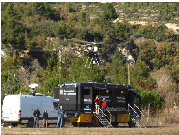
Figure 4: Unmanned Aircraft and Control Station on November, 25th -the first CLOSE-SEARCH test campaign

The results were satisfactory from the overall integration point of view, and particularly for the remote sensing component. With respect to the latter, several targets were deployed on the field (ground targets, human, etc.) and the UAS/UA flew over them. The goal was to validate the proposed GSDs to enable body recognition using thermal images and, as described in section 2.2, this goal was achieved. Nonetheless, on the navigation/control tasks, no performance results were obtained as the equipments were used on the acquisition mode and thus no UAV control tasks were performed using the EGNOS-based navigation solution.