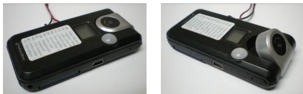
Figure 4. The modified FlyCamOne-2 pocket camera

The current camera is the modified version of the FlyCamOne-2 pocket camera (Figure 4.).