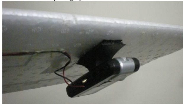
Figure 5. The camera under the left wing

the camera is easily mountable on different surfaces, such as the wings or fuselage of a model airplane. On the holder four electrical pins were installed, two pins for charging the camera and two pins for triggering it with a spare channel on the transmitter. The head of the camera with the optics is turnable with the help of a servo, installed to the end of the holder. During the field test the head was fixed in vertical position to take near-vertical photographs or videos.