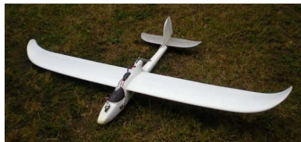
Figure 1. The 'Easy Star XXL' model airplane

The platform is characterized by a traditional configuration: fixed wing glider airplane, rear-mounted horizontal and vertical stabilizers but driven by a pusher, electric motor, placed on the top of the fuselage to avoid the breaking of the propellers in case of crash landing. Due to this configuration, it is more resistant to weather conditions, such as wind and gusts than other platforms. After some test flights without payload, the original wings were replaced by the bigger wings of an other model airplane (Easy Glider – manufactured by the same company) to increase the area of the wings (Figure 1.). The original wing size was equal to 24 dm 2 and with this improvement the surface of the wings, as well as the payload capacity and gliding capability, was nearly doubled (41,6 dm 2 according to the manuals, printed by Multiplex GmbH).