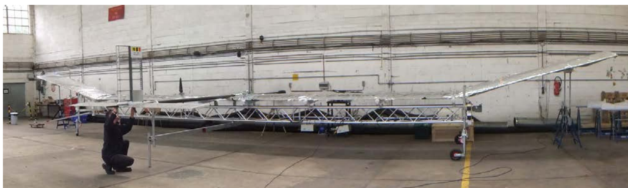
Figure 1. Mercator being prepared at Bertrix airfield